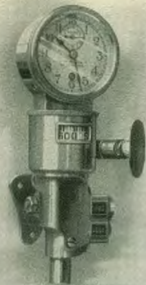
Model "H" Price $90.00

Same as Model "F" but with Speed Dial indicating to 100 miles per hour.