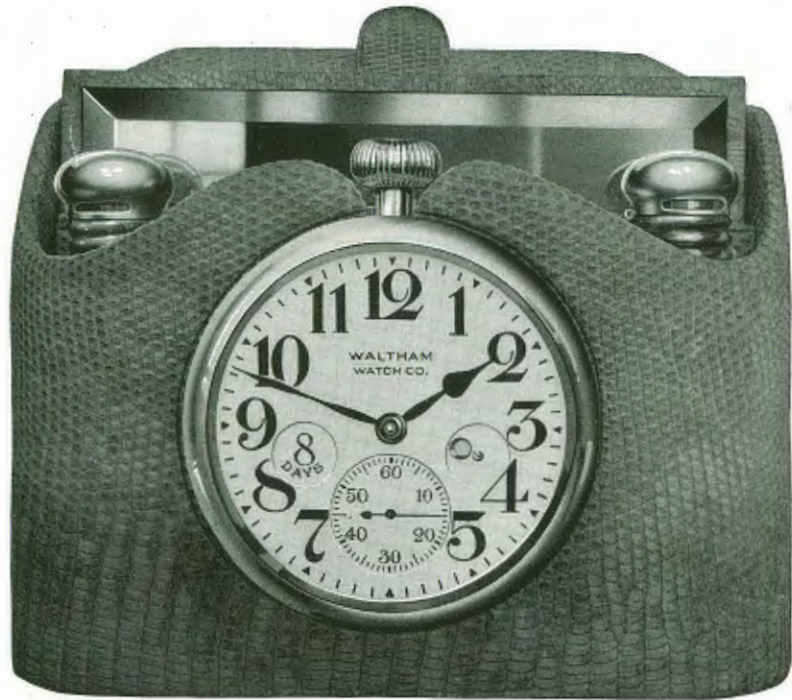
LIMOUSINE SET TWO-THIRDS ACTUAL SIZE

The timepiece is similar to the other movements described in this book, but it is mounted in an attractive leather case, which also contains a fine plate-glass mirror and two cut-glass vial-glasses with sterling silver tops. The cases are furnished in either Glazed or Lizard Leather.