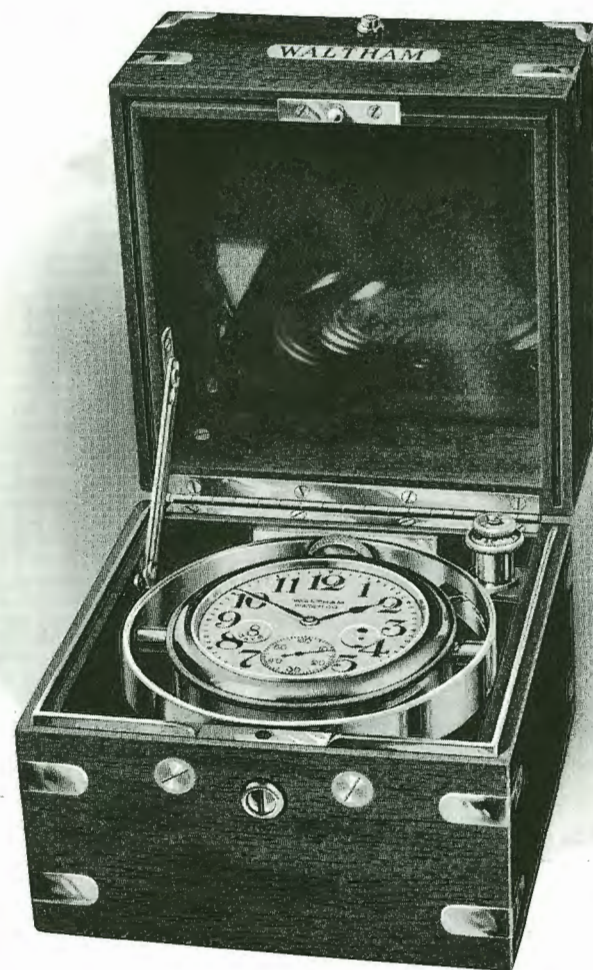
WALTHAM BOX CHRONOMETER FOR WATCHMAKERS AND YACHT NAVIGATORS