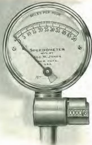
Model 22, 3 inch dial, 50 mile $25.00

☞ Models 20, 21 and 22 shown above have been added to our line to meet the demand for inexpensive instruments to be used for Cars of moderate cost.